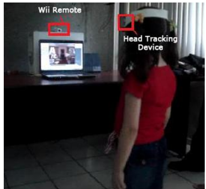
Figure 5. Playing Fallbox.

Other important part is the ergonomic and the usability of this device; was designed to be used for all kind people (no matter genre or age), mounting it on an elastic band adapted to the head shape of the player (see Figure 5).