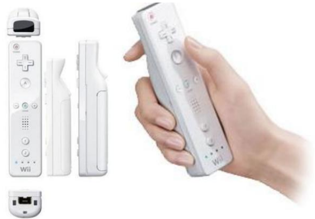
Figure 2. Nintendo Wii Remote.

If you use a LED array and some reflective tape, you can use the infrared camera in the Wiimote to track objects.