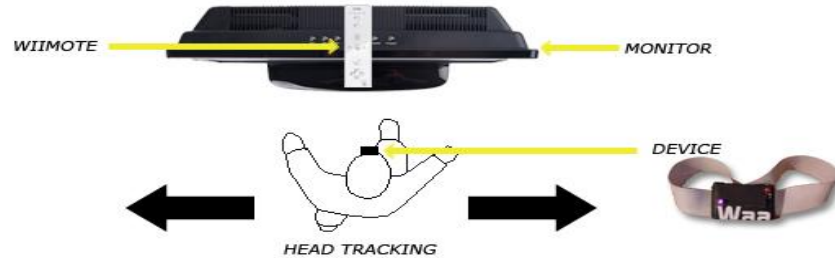
Figure 1. Schematic diagram of a head-tracking system.

Infrared camera can detect infrared light, that spectrum of human vision cannot see, the light is detected in some point of vision of camera angle and for calculate the movement of the transmitter comparing two signal in a space of time.