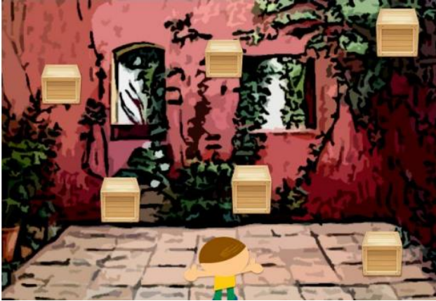
Figure 3. Fallbox computer game.

To play it, we created an interaction device (see Figure 4) that is placed on the player's head which consist of an infrared LED that point to the Wii Remote and is the responsible for indicating the position of the player in the game. So the player has to move to control the avatar and dodge the boxes that are falling down game.