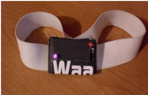
Figure 4. Head-tracking interaction device.

To play it, we created an interaction device (see Figure 4) that is placed on the player's head which consist of an infrared LED that point to the Wii Remote and is the responsible for indicating the position of the player in the game. So the player has to move to control the avatar and dodge the boxes that are falling down game.