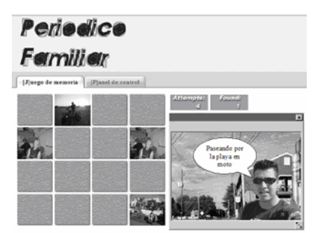
Figure 4. The Virtual Player - Entertainment Section.

Real Player Agent : If a relative decides to join a game of memory with the elder, the Real Player Agent is started. Then, it is connected to the game server, which is the Memory Game Agent. The Real Player Agent has an IM client through which the user can maintain contact with the elder while they are playing.