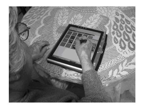
Figure 3. The Memory Game - Entertainment Section.

Memory Game Agent : When the elder joins the Entertainment section, he or she is presented with several activities, such as the Memory Game. The Memory Game Agent is a server application that monitors the movements of the players, and validates them. It also maintains a database with images and a brief story describing them. If the elder chooses to play, this agent will generate a set of cards with the images posted in the weblog, as illustrated in Figure 3.