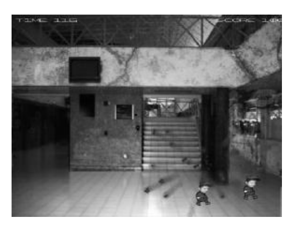
Fig. 1. The game.

The focus of this work is the user interaction, so three different techniques were used for interaction between the user and the game.