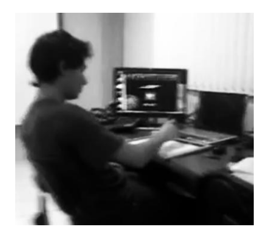
Fig. 3. Interaction with pen recognition.

Our game use the DUO digital pen [9] as pen input recognition, which offers the possibility of combining the use of an ordinary pen with the function of a mouse. In this way, it is possible to have the functions like a tablet without having to buy one and is simple and elegant.