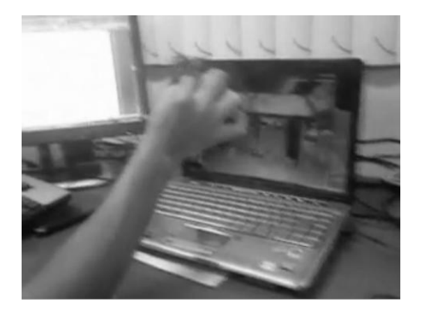
Fig. 5. Vision recognition interaction.

With the help of this technology we used two tapes wrapped in the fingers, each a different color, with the aim of facilitate the system detection of such objects, one tape for the index finger and one for the thumb, the movement of these fingers represents the game's cursor movement and the contact between them represents a shoot by the player (see Fig. 5).