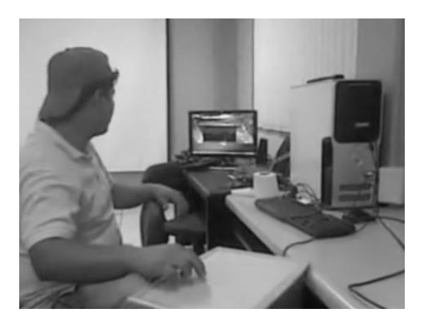
Fig. 4. Player interacting with the gesture recognition.

The user can interact with the game moving her hand through the opaque surface and shoot with the up and down of her finger, the user develops a new experience, this time with a surface that interacts on an haptic way to the person, enhancing the player's experience. (see Fig. 4).